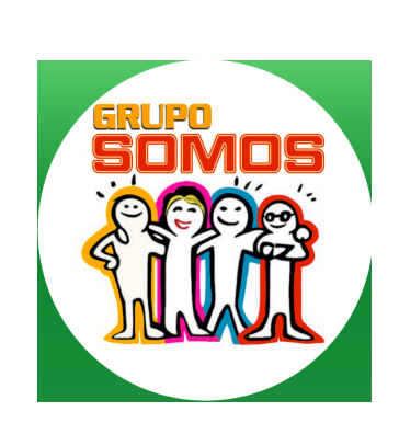
Support Group For Latinos Living with HIV