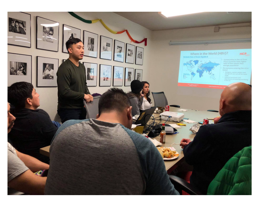
EH community presentation