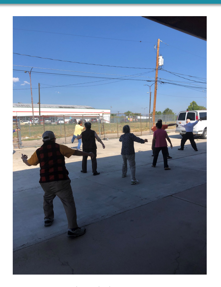
Practicing Tai Chi with the Cantonese Elder Wellness Group, August 2019