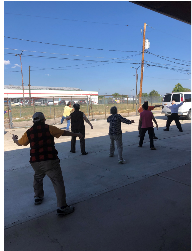
Practicing Tai Chi with the Cantonese Elder Wellness Group, August 2019